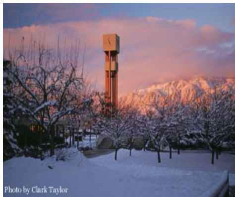
Weber State University Stewart Bell Tower

The Utah Victim Assistance Academy's goal is to support efforts to improve comprehensive, academically-based, fundamental education for victim assistance providers, criminal justice personnel, law enforcement and allied professionals